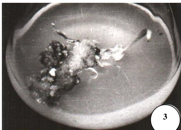
Fig. 3: Photograph showing callus morphogenesis on auxin free MS medium with Kinetin, ascorbic acid and coconut water.

B- Embryoids formed in embryogenic normal culture were picked up and transferred to MS medium containing Kn (0.5 mg/L) + ascorbic acid (25 mg/L) and 150 mg/L coconut water containing filtrate of cultures from saprophytic growth of the fungus Sclerospora graminicola . Filtrate from the fungus culture was extracted, through sterile muslin cloth and centrifuged for 15 min at 4°C. The sterile filtrate was used for experiments. Various concentrations of aseptic filtrate (20-300 mg/L) were incorporated into above mentioned callus differentiating medium.