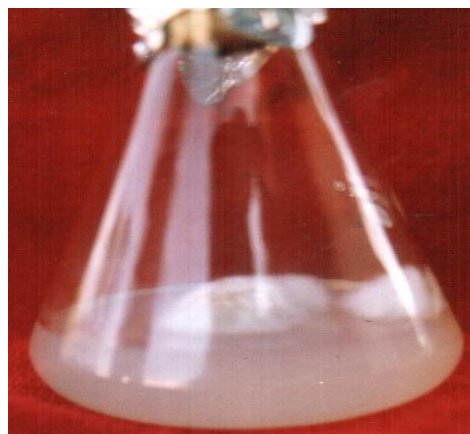
Fig. 2: Photograph showing axenic culture of Sclerospora graminicola on liquid MS medium with casein hydrolysate (3g/L) and biotin (1.5 mg/L).