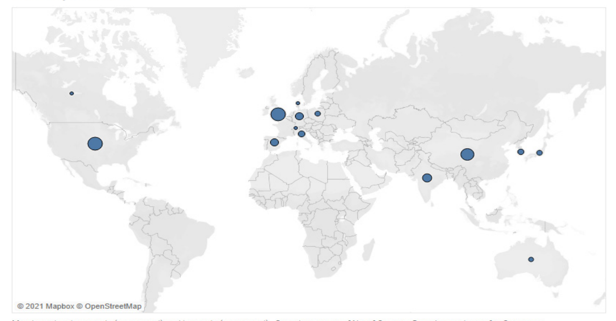
Map based on Longitude (generated) and Latitude (generated). Size shows sum of No.of Counts. Details are shown for Countries Figure 1. Density world map of the top countries in terms of research publication citations.