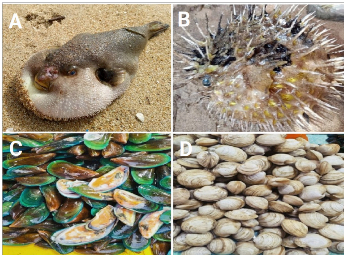
Figure 2. (a) Balloon Fish, (b) Globe Fish, (c) Oysters, (d) Cockles.