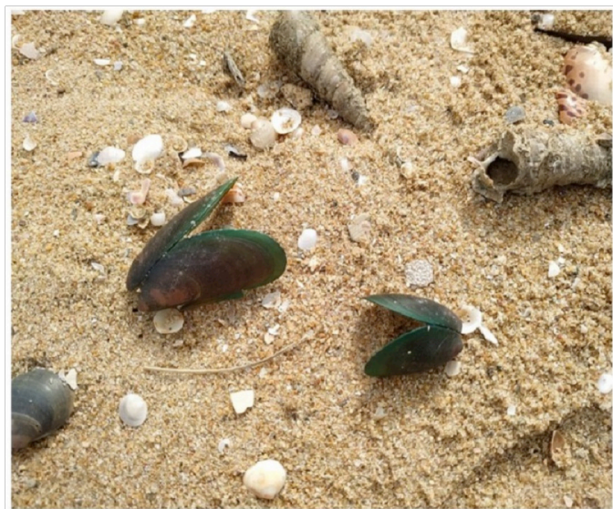
Figure 3. Amnestic fish poisoning containing domoic acid.

Domoic acid is a key factor with amnesic shellfish poisoning involved in isodomoic acid D, isodomoic acid E, and isodomoic acid F (Fig. 3). All of these are plankton products. It acts as a glutamate receptor agonist and has a high affinity for quisqualate glutamate receptors. The glutamate receptor opens Na + ion channels in the postsynaptic membrane, causing it to depolarize. This increases Ca ion permeability, which eventually leads to cell death (Mattei et al. , 1999). The DA toxicity process takes place primarily in mitochondria, where uncoupling of oxidative phosphorylation occurs, resulting in cell swelling and, eventually, lysis due to decreased membrane permeability. DA showed no mutagenic action on the pulmonary fibroblast hamster V79 cells, apart from neurotoxic and gastro toxic activity (Hampson et al. , 1992). Within 24 hours, symptoms such as nausea, vomiting, headache, diarrhea, or abdominal cramps are observed, or at least one of the following neurological symptoms or signs occur, causing confusion, memory loss, disorientation, or other serious neurologic signs such as seizures, coma, or death (Rogers and Boyes, 1989). DA exposures lead to a strong c-fos induction in the brain, a reduced cardiac impact, and no kidney or liver effect. The induction of c-fos in the brain has been traced to two main areas: the brain stem and the limbic system. Vomiting