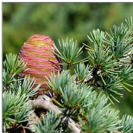
Fig. 1: Cedrus atlantica Manetti of Morocco.