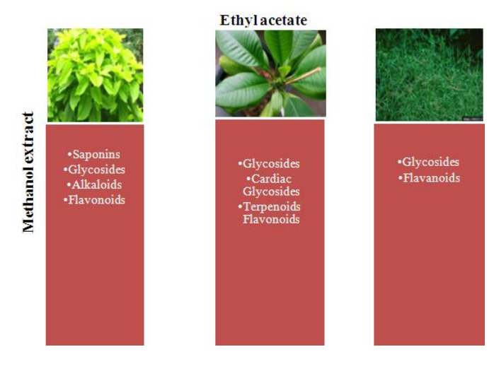
Fig. 3: Phytochemical profile of the plant extracts.

Phytochemical screening of Plumeria alba exhibited the presence of saponins, glycosides, cardiac glycosides, flavonoids and terpenoids while Pisonia alba showed the presence of saponins, glycosides, alkaloids and flavonoids. Cynodon dactylon expressed glycosides, flavonoids and terpenoids. Based on the phytochemical content ethyl acetate extract of Plumeria alba and C. dactylon and methanol extract of Pisonia alba were retained for further studies. Figure 3 depicts the phytochemical composition of the plant extracts. Our findings show that Cynodon dactylon exhibit significant anti-biofilm at a concentration of 20 µg/mL. This can be attributed to the phytochemical constituent of C. dactylon. From the composition of phytochemicals it can be proposed that the flavonoids content contributes to biofilm inhibition. Flavonoids from various sources are potent anti-biofilm agents which inhibit biofilm by bacteria such as Streptococcus mutans, Aeromonas hydrophila and Escherichia coli (Koo et al., 2000) (Vikram et al., 2010) (Sanchez et al., 2016). Lee et al. (2010) reported the action of phloretin, a flavonoid at concentrations of 25 and 50 g/mL against biofilm of E. coli O157:H7 by 89 and 93%. However this is the prime report on antibiofilm activity of C. dactylon against P. aeruginosa. In addition the extract shows considerable amount of antioxidant activity.