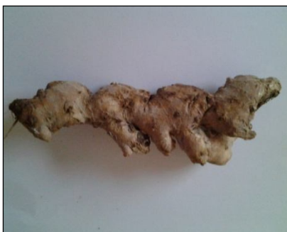
Fig. 2: Zingiber zerumbet rhizome.

Randhawa (2008) have reported the antioxidant activity of thymoquinone which is the main component of Ns can inhibit the development of several types of cancer. In vivo study by Rooney and Ryan (2005) revealed that the antioxidant activity of thymoquinone was able to protect rat liver against induced hepatocarcinogenesis and non toxic to the normal cells. Although the single effect of Ns and Zz extracts has promising anti cancer activities there is no study showing combinatorial effects of both plant extracts on human myeloid leukemia (HL60) cell. Combination is the promising approach used in drug discovery for increasing the effectiveness of anticancer therapy (Amy et al. 2009). Despite combination approach promising outcomes in pre clinically and clinical studies the therapeutic effectiveness of drug delivery systems emerges to greatly rely on the biological activity of drug payloads. Hence the concentration of the drug at the site of action and delivery schedule is the core for drug activity (Smalley et al. 2006). Consequently it is critical to identify the optimal combination settings for evaluation the type of interaction of both Ns and Zz extracts at the appropriate concentration.