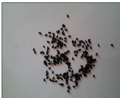
Fig. 1: Nigella sativa seed.