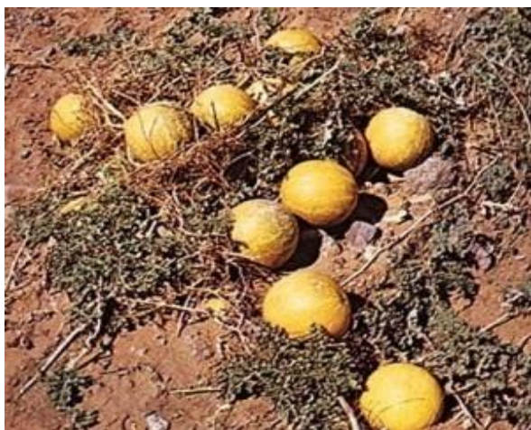
Fig. 1: Bitter Apple ( Citrullus colocynthis ).

Citrullus colocynthis (CCT) plant were collected during August and September from the desert area of Maârif (35,5°W and 5,25°N) in province of Boussaâda, Wilaya of M'sila, Algeria. The plant was identified, authenticated by Botanist Pr. H. Laouer, Department of Biology, Ferhat Abbas University, Setif, Algeria. Fruits were washed and shade dried. Seeds were separated manually from the pulp of the fruits and then minced with electrical grinder (Muleinex) into a powder and finally stored in airtight containers prior to use (Fig. 1, 2).