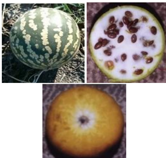
Fig. 2: Fruit of Citrullus colocynthis in its dried and fresh forms with cut section.