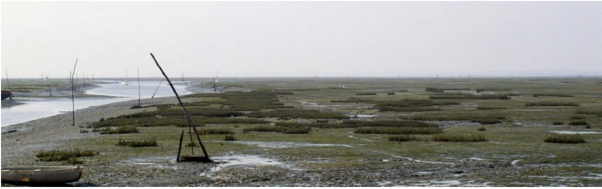
Fig. 1: View of the intertidal flats at Taussat showing the invasion of S. anglica in the Z. noltii meadow.