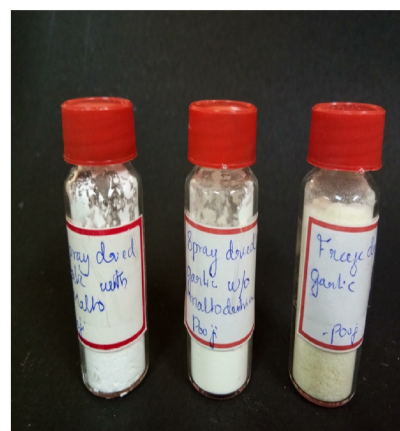
Figure 2. Representation of garlic powder.