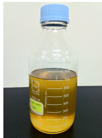
Figure 1. Garlic extract obtained from ultrasonication.

The cognition of food density is essential for processing, packaging, shipping, and storage. In general, the powder obtained with maltodextrin expressed higher bulk and tapped density. The change in these properties is mainly due to the solid content, viscosity, and temperature of the feed. There is no significant difference between the density of freeze-dried garlic powder and spray-dried powder with maltodextrin. During the process of drying, moisture removal tends to increase the solid content. Spray-dried garlic powder with maltodextrin is found to have more density when compared to those treated with the other two methods. The addition of maltodextrin has increased the tapped and bulk density of the product. The bulk and tapped densities of the freeze-dried sample were also more