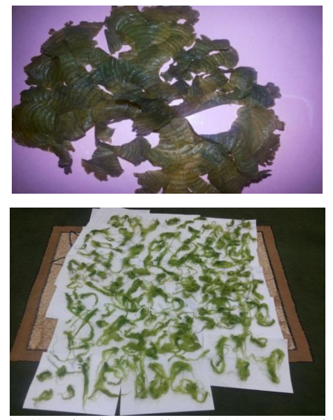
Fig. 1: (A). Padina boryana Thivy and (B). Enteromorpha sp

Two marine algae were collected by hand picking from the Red Sea in Al-Leith Provence, Saudia during June 2015 (Fig. 1). Algal samples were cleaned from epiphytes, extraneous matter and necrotic were removed. Samples were washed thoroughly, air dried, cut into fine pieces and then ground in a tissue grinder until reach fine powder shape.