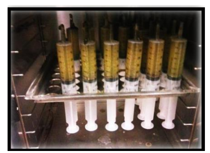
Fig. 3: Syringes with artificial saliva (25ml) and ruminal liquid.