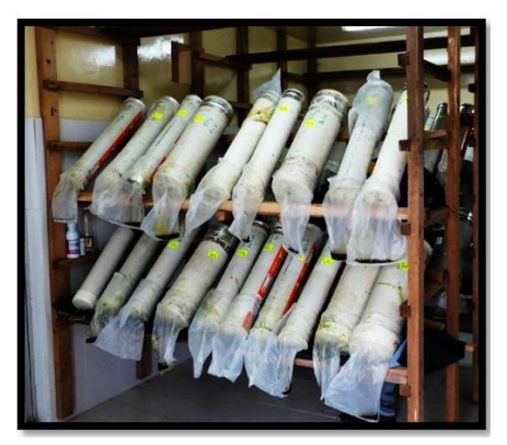
Fig. 1: Micro silos with air valves and hoses infusion.

The whole crops were collected from a farm in Instituto Nacional de Investigaciones Agropecuarias (INIAP) in Pichincha Province. Silages were prepared using a small scale, a forage mixture divided into three treatments with: Lolium perenne-Trifolium pratense (RG-TR), Avena sativa–Vicia sativa (A-V) and Zea mays (RM), approximately 3 kg of mixture forage material (30% legume and 70% grass) chopped into about 1-3 cm length and packed into PVC tubes of 50 cm of large. The tubes were filled with a solution of water, molasses and urea in proportions of 10%, 5% and 0.1% respectively, according to the weight of micro silages. 9 micro silos was performed, three for each vegetable mix. The micro silos were stored in a room at ambient temperature (Fig. 1).