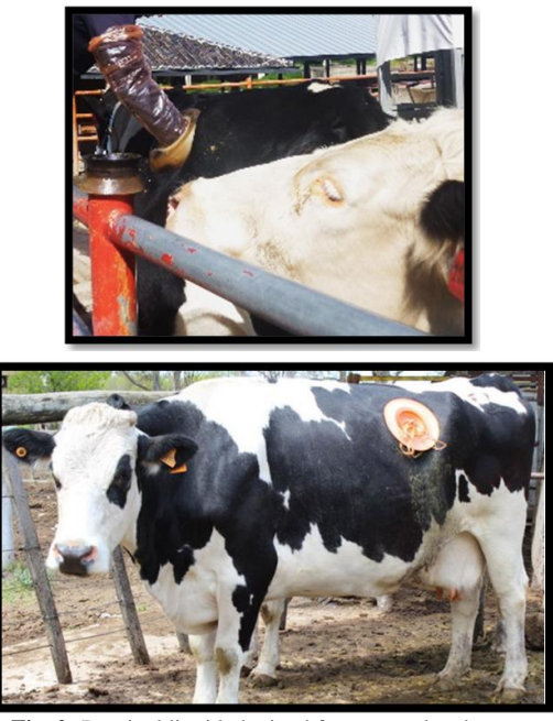
Fig. 2: Ruminal liquid obtained from cannulated cows.

hours so that the g4gb net weight of the digested dry matter can be measured.