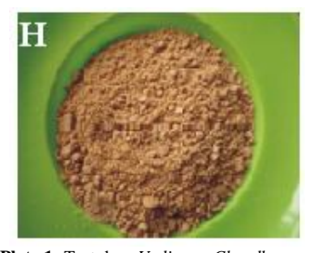
Plate 1: Test drug Vediuppu Chendhuram

Values are mean of 6 animals ± S.D. (Dunnett's test). *P<0.05; **P<0.01. N=6.