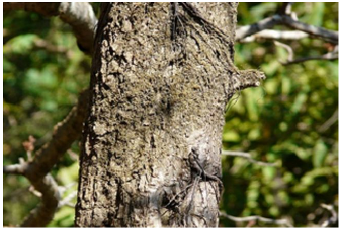
Fig. 1: The diagram showing the bark of Hymenodictyon excelsum .

The search for anti-cancer drugs from plant sources started in earnest in the 1950s with the discovery and development of the vinca alkaloids, vincristine and vinblastine, and the isolation of the cytotoxic podophyllotoxines.