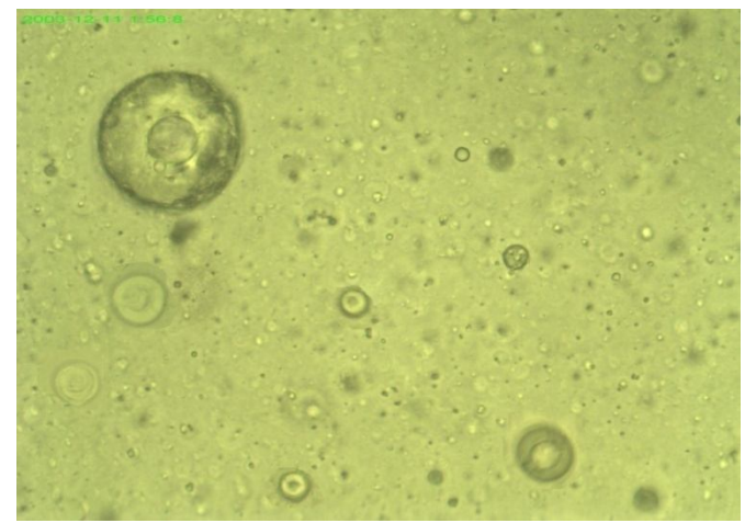
Fig. 1: photomicrograph of Proniosomal gel taken under Boeco NIB-100 (germany) at 100X magnification.