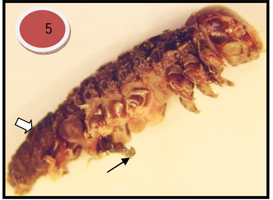
Fig. 1-5: Morphological changes induced by the crude H. brevipes extract. 1- Dorsal view of the head and thorax of a control S. littoralis larva showing normal mouth parts. 2- Lateral view of a treated larva that completely failed to shed its old cuticle, resulting in shrinkage and finally death. 3- Lateral view of the non-functional mouth parts in the ecdysis-inhibited treated larva. 4-5: Lateral view of treated larvae, showing the partial moulting that preceded death in some cases. 4- Moulting occurred only on the dorsal side of this treated larva. 5- A larva with a partially-shed old cuticle and a deformed head and abdominal legs (indicated by the dark arrow) while other body parts remain encased in the old cuticle (white arrow).