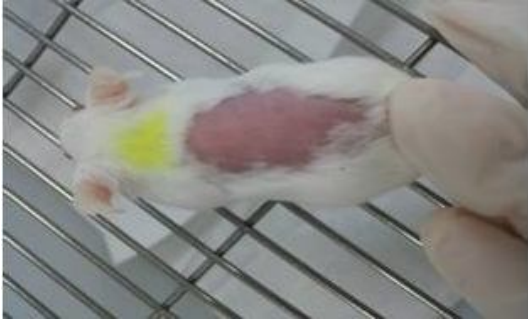
Fig. 5: Representation of no signs of irritation observed on dorsal trunks of mice in the untreated group and all groups treated with scales powder.