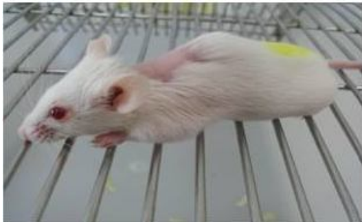
Fig. 3: Fig. 3: No erythema formed on mouse ears tested with 2000 mg/kg of scales powder.