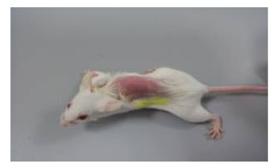
Fig. 4: Erythema formed on a mouse dorsal trunk within the first hour of treatment with 0.03 ml xylene.